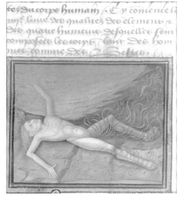
lot of it, and on wet ones very little, which is then accumulated inside us similar to fog and mist it works on our implanted spirit.»

We continue with the work of an Early Byzantine writer, Alexander of Tralles (10). I quote: