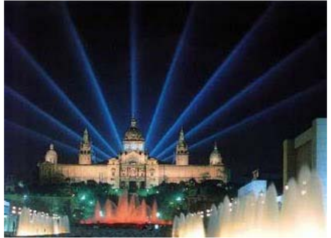
The Fountain of Montjuic