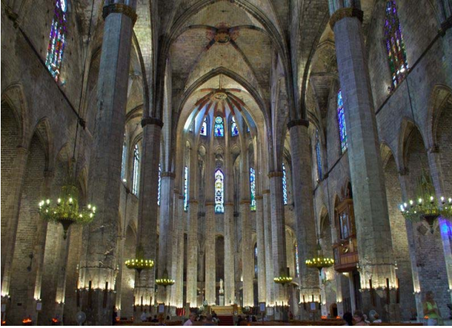
Basilica Santa María del Mar