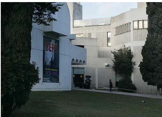
The Joan Miró Foundation

Barcelona combines the gentleness of the Mediterranean shores with the drive and capacity of a young society. A privileged geographical location, exciting atmosphere, almost as lively at night as it is during the day, the metropolis provides the visitor with an unforgettable experience.